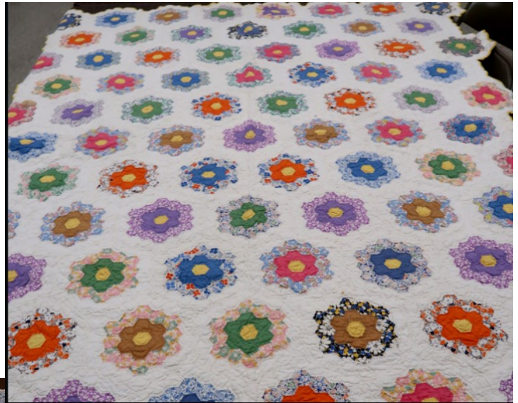
Quilt & Trunk