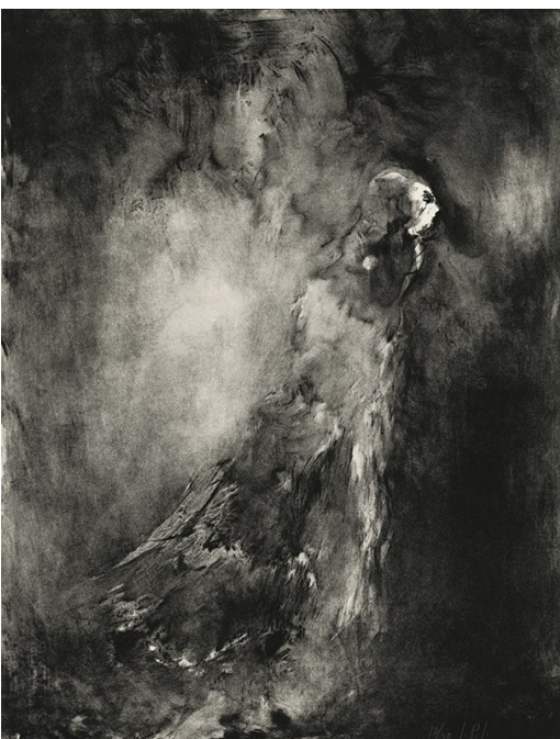
Print, Night Lady

John Paul Jones 1965 oil painting from the series Great Ideas of Western Man. Smithsonian American Art Museum. John Paul Jones, "No man for any considerable period can wear one face to himself, and another to the multitude, without finally getting bewildered as to which may be the true." Nathaniel Hawthorne, The Scarlet Letter, 1850.