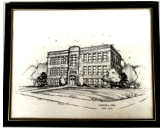
Drawing of Carlisle High School 1918-1993. Donated

2022, Wind/hail damage to General Store, Mt. Hope and Pioneer Church got new roofs