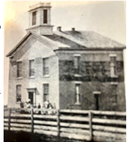
“Old Bluebird” was first building at Simpson College. It was a two story brick building that was painted with gray lead paint. The first floor had two rooms and the second three. The paint gave it a bluish gray color and it was nicknamed Bluebird. It was destroyed by a storm in 1871,

Sally Spear brought in two Thumb Stalls that were used on her thumbs to keep her from thumb-sucking in 1954. They were tied to the child's thumb.