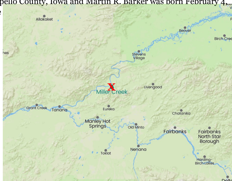
Miller Creek near Fairbanks Alaska