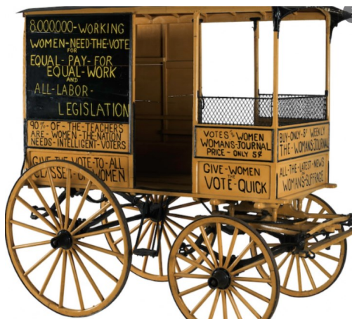
SUFFRAGE WAGON REPLICA | Iowa 19th Amendment Commemoration