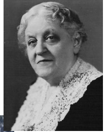
Iowan Carrie Chapman Catt