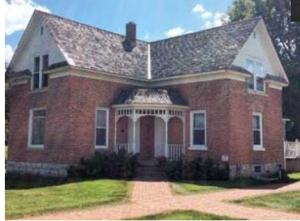
Carrie Chapman Catt's House