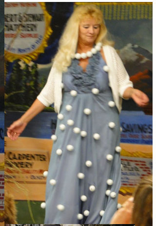
BALLGOWN Ping-pong That is