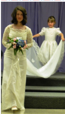
Photos from our June Wedding Style Show.

If you didn't at- tend, you missed great food, fash- ion and fun.