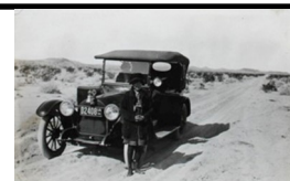
1917 Mohave Desert