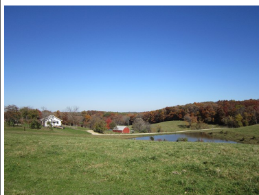
On Lake Ahquabi, 344 acres, horses, camping and retreats