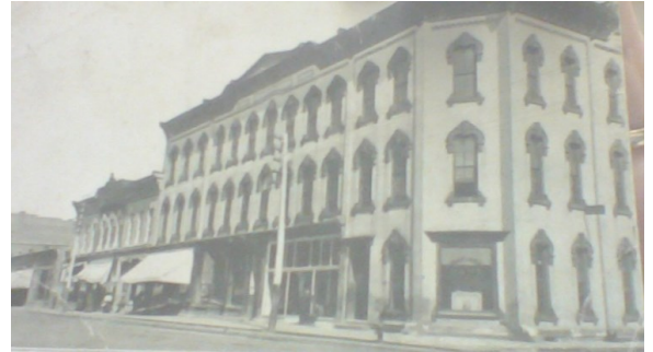
Upper two stories Central Hotel

CORBETT HOUSE: (Name by Editor) an old frame hotel that stood where the Warren Hotel, now stands