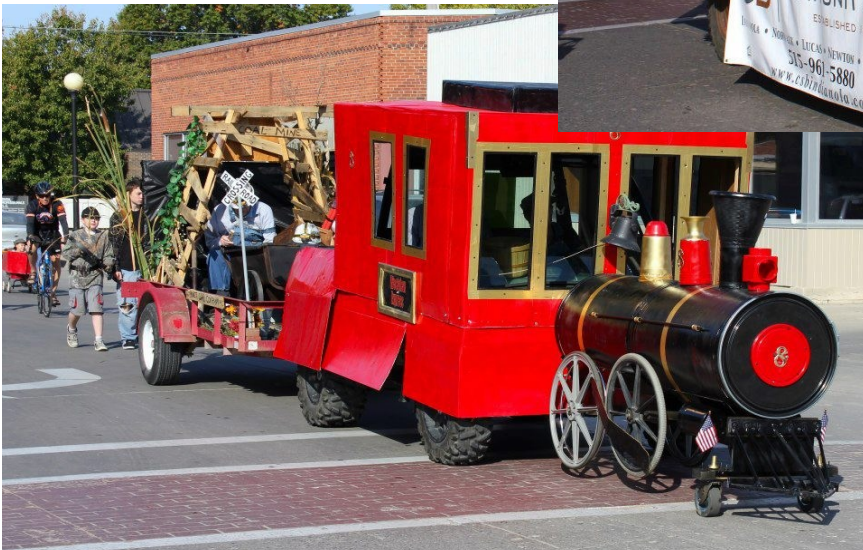
Westview Care Center Best Festival Summerset Theme