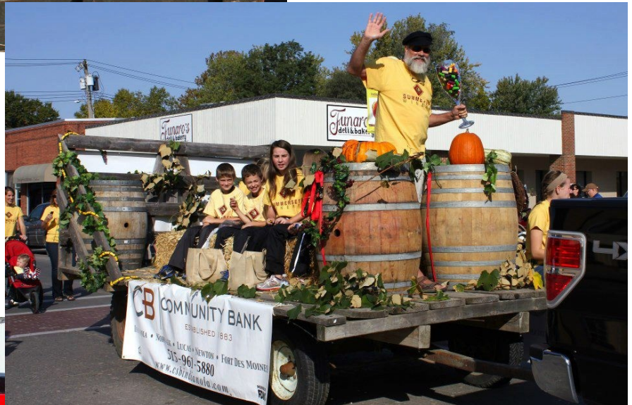
Community Bank & Summerset Winery Winner of Parade Merchants' Choice