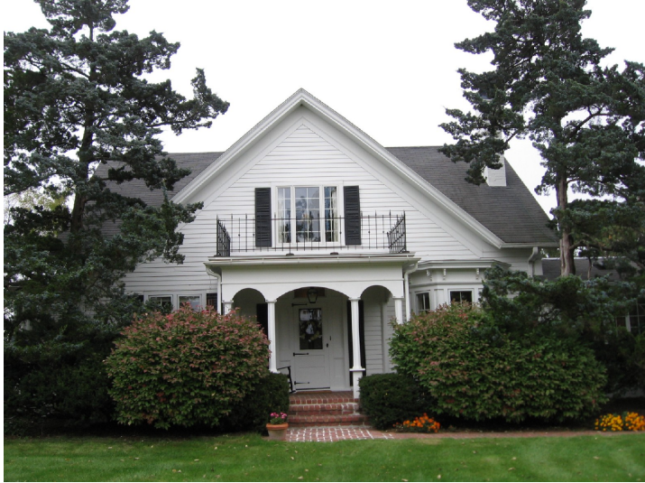
Scotch Ridge Road 150 year old house built for Wm Buxton