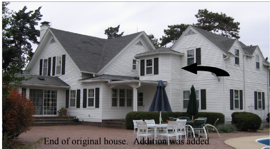
End of original house. Addition was added.