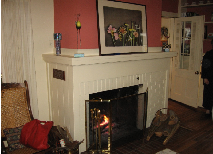
Original fireplace, still in use

North of this house was an orchard with a large elm called the "Meeting Elm". Many Scottish